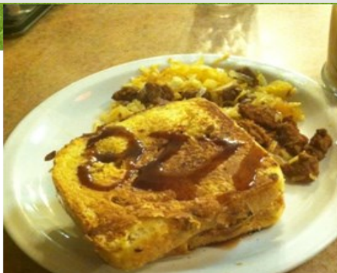
Following the competitions at McKeesport and Baldwin, the band met up at Denny's at convinced the waitress to write the score they received on pieces of French toast.